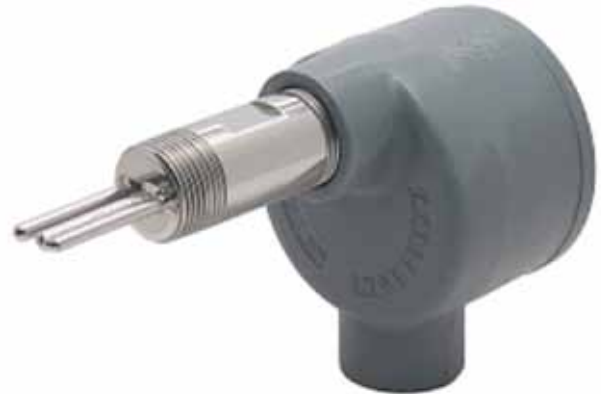
FX Series Flow Switch