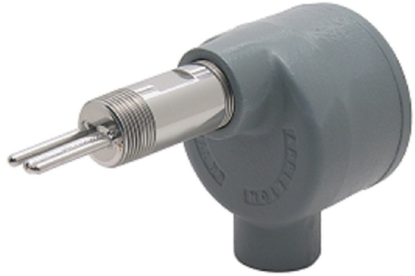
FX Series Flow Switch