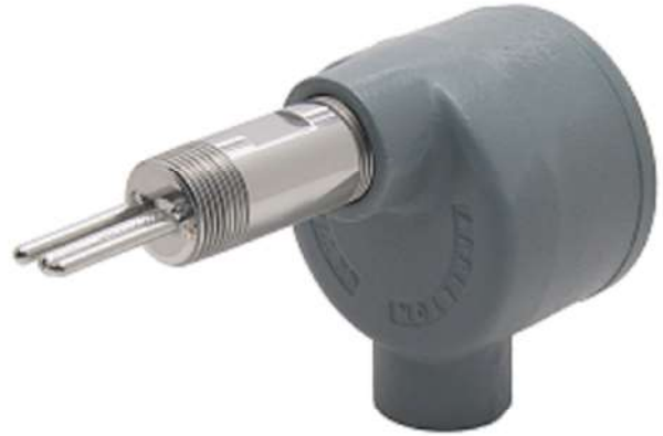
FX Series Flow Switch