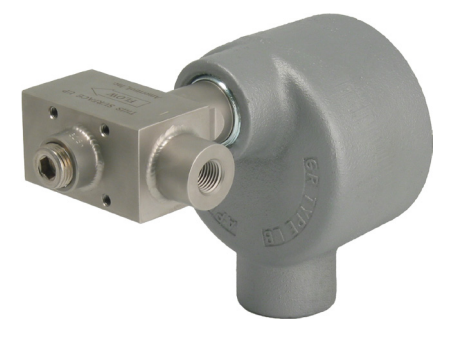
IX Series Flow Switch Brochure (PDF) www.ameritrol.com

Ameritrol offers a complete line of flow switches for water purification and automation requirements. The FX series flow switch reliably detects the flow of incoming water for treatment. The relay output from the FX flow switch can be used to control a UV light or chemical injection pump for dosing water additives. This dependable no moving parts design is ideal for detecting low flow rates yet rugged enough to withstand higher flow rates.