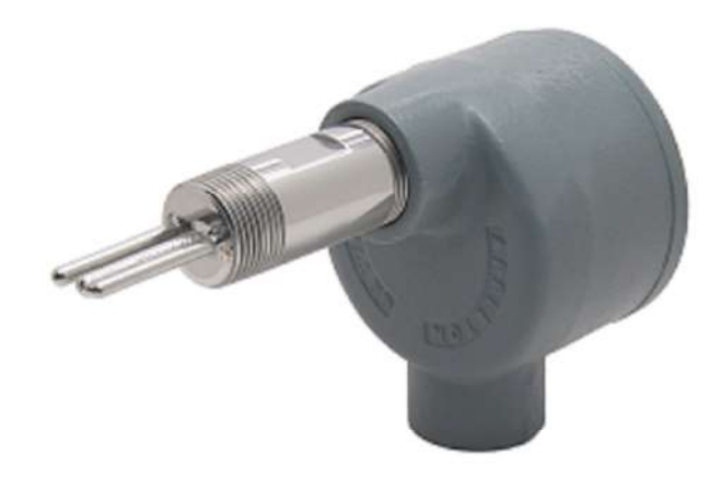
FX Series Flow Switch Brochure (PDF) www.ameritrol.com

The FX series pump protection flow switch provides reliable service for the most demanding pump protection applications. This dependable no moving parts design is ideal for use in virtually all liquids and slurries from light weight hydrocarbons to hot asphalt.