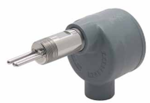
FX Series Flow Switch