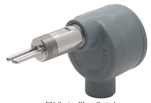
FX Series Flow Switch Brochure (PDF) www.ameritrol.com

The FX series flow switch provides reliable service in fume hood exhaust and HVAC applications. This dependable no moving parts design is ideal for fume hood exhaust monitoring where flow rates can be very low. Undetected fume exhaust loss can result in noxious, hazardous or flammable conditions.