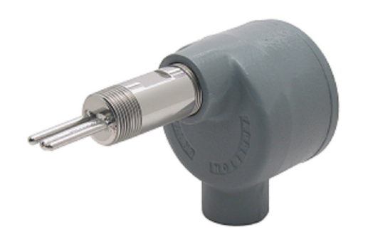
FX Series Flow Switch

An FX series flow switch located on the main supply line can be used to control a chemical injection pump for dosing water additives. The FX model is available with wetted parts of 316L stainless steel or exotic alloys such as Hastelloy C-276. Monel/Alloy 400, Titanium and Carpenter20/Alloy 20. The IX is available in 316L stainless steel and Hastelloy C-276 for tough corrosive applications. Both the IX and FX series flow switches provide excelent performance and cost savings.